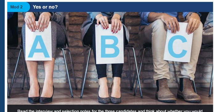
Read the interview and selection notes for the three candidates and think about whether you would recruit them, and if not, your reasoning. Click each of the letters above to see more.